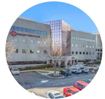
6140 CURTISIAN BOISE, ID 83704 LANDLORD REPRESENTATION