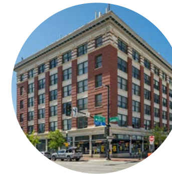
IDAHO BUILDING 280 N. 8TH STREET, BOISE, ID 83702 LANDLORD REPRESENTATION