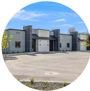
TOUCHMARK OFFICE CONDOS 3512 & 3526 E LOUISE DR, MERIDIAN, ID 83642 SELLER REPRESENTATION