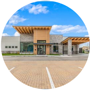
3190 BARBER VALLEY DR BOISE, ID 83706 SELLER REPRESENTATION