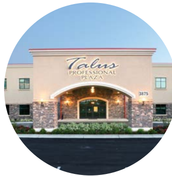
TALUS PROFESSIONAL PLAZA 3875 E. OVERLAND ROAD, MERIDIAN, ID 83642 LANDLORD REPRESENTATION