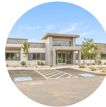
AIRPORT CENTER IV 3264 W ELDER ST, BOISE, ID 83705 LANDLORD REPRESENTATION