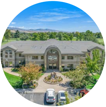
RIVERSIDE BUSINESS CENTER 7655-7669 W, RIVERSIDE DRIVE, BOISE, ID 83714 LANDLORD REPRESENTATION