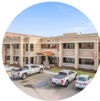
CURTIS BUSINESS PLAZA 1070 N CURTIS RD, BOISE, ID 83706 LANDLORD REPRESENTATION