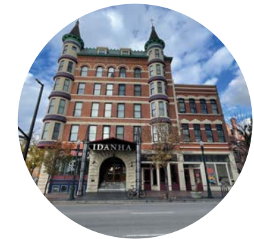
IDANHA BUILDING 928 W MAIN ST, BOISE, ID 83702 LANDLORD REPRESENTATION