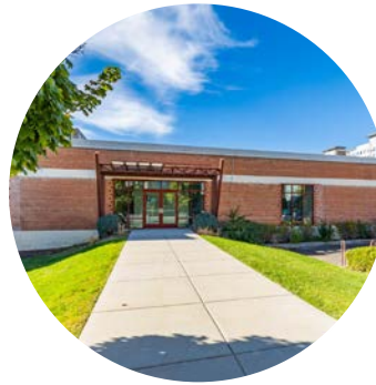
FRONT 5 BUILDING 521 W FRONT ST, BOISE, ID 83702 LANDLORD REPRESENTATION