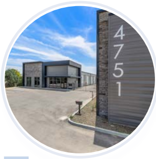
CLUB STORAGE CONDOS SALE | 73,100 SF SELLER REPRESENTATION | JUNE 2025