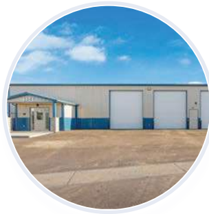
3341 BLACK BUTTE COURT SALE | 4,000 SF BUYER REPRESENTATION | APRIL 2024