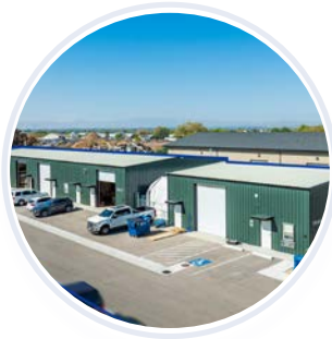
3605 & 3617 COMSTOCK SALE | 9,900 SF SELLER REPRESENTATION | APRIL 2025