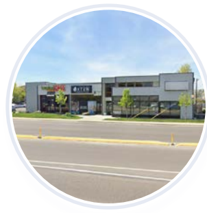
BROADWAY RETAIL SALE | 8,767 SF BUYER REPRESENTATION | FEBRUARY 2026