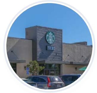
STARBUCKS MERIDIAN SALE | 2,300 SF BUYER REPRESENTATION | DECEMBER 2024