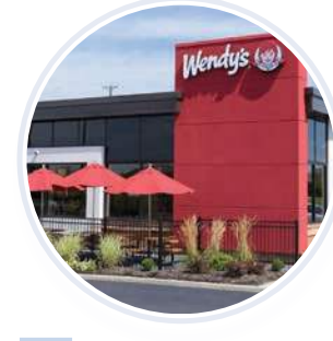
WENDY'S CALDWELL / KUNA SALE | 2,727 SF / 2,468 SF BUYER REPRESENTATION | OCTOBER 2024