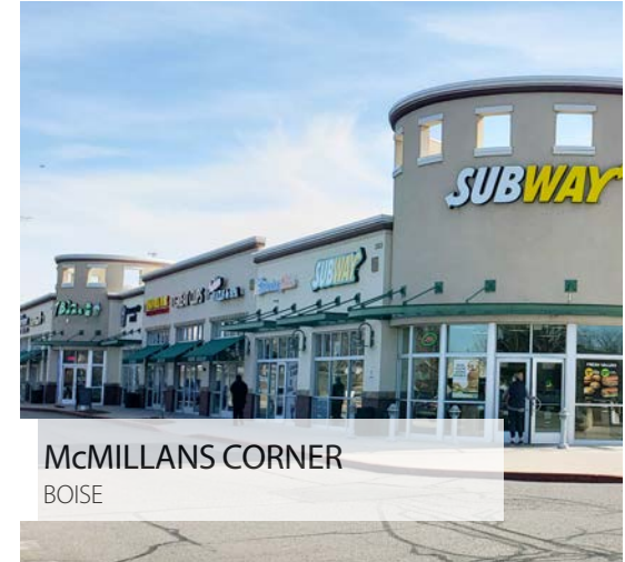
McMILLANS CORNER BOISE

Two Multitenant Retail Centers Landlord Representation 2024-Present