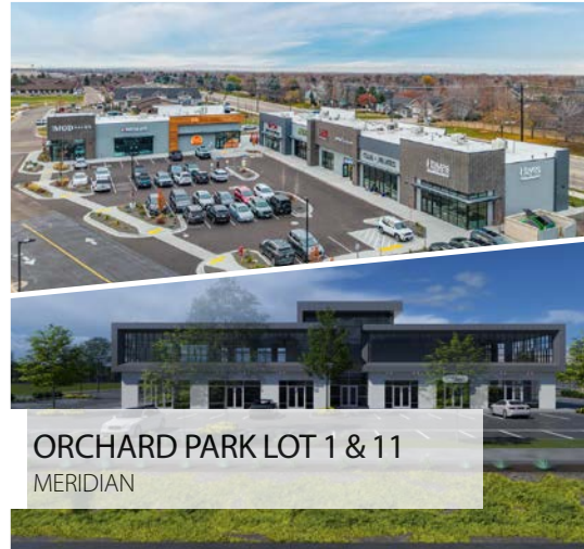
ORCHARD PARK LOT 1 & 11 MERIDIAN

(208) 947-0852 | jpgreen@tokcommercial.com