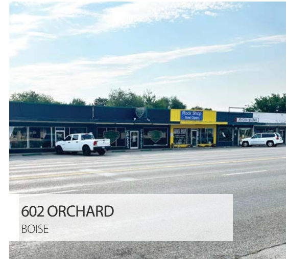
602 ORCHARD BOISE

21,000 SF Multitenant Retail Center Landlord Representation 2019-Present