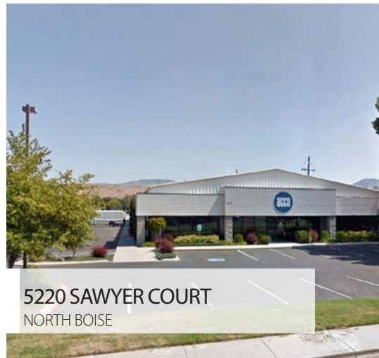
5220 SAWYER COURT NORTH BOISE

Owner | Landlord Representation 101,210 SF Multitenant Industrial Building 2007-Present