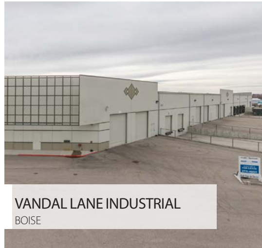
VANDAL LANE INDUSTRIAL BOISE

Landlord Representation 82,851 SF Multitenant Industrial Building 2007-Present