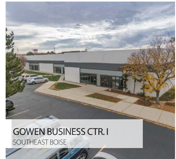
GOWEN BUSINESS CTR. I SOUTHEAST BOISE

Landlord Representation 21,164 SF Flex Building 2018-Present