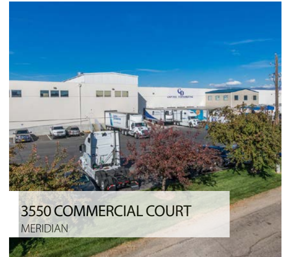
3550 COMMERCIAL COURT MERIDIAN

Landlord Representation 82,851 SF Multitenant Industrial Building 2007-Present