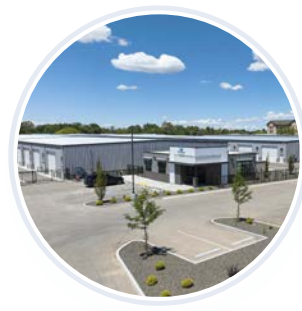
FALCON STORAGE CONDOS SALE | 2,391 SF BUYER REPRESENTATION | OCTOBER 2024