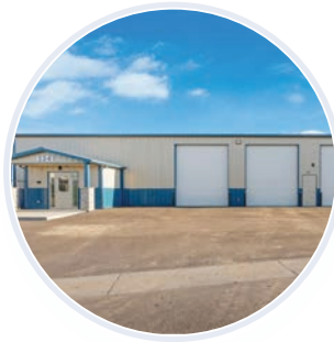
3341 BLACK BUTTE COURT SALE | 4,000 SF BUYER REPRESENTATION | APRIL 2024