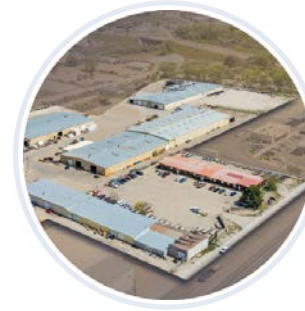
312 SIMPLOT SALE | 146,900 SF SELLER REPRESENTATION | JUNE 2024