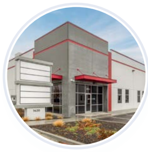
KARCHER INDUSTRIAL PARK SALE | 35,200 SF SELLER REPRESENTATION | SEPTEMBER 2024