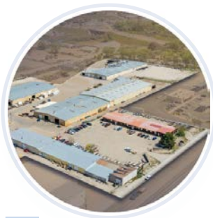
312 SIMPLOT LEASE | 24,000 SF TENANT REPRESENTATION | OCTOBER 2024