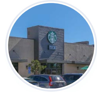
STARBUCKS MERIDIAN SALE | 2,300 SF BUYER REPRESENTATION | DECEMBER 2024