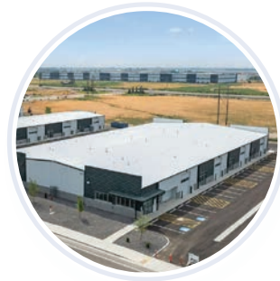
NORTH RANCH INDUSTRIAL SALE | 26,040 / 16,900 SF SELLER REPRESENTATION | OCTOBER 2024