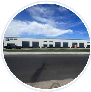
4919 LASTER STREET LEASE | 2,250 SF TENANT REPRESENTATION | DECEMBER 2023