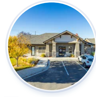
CASTLEBURY WEST SALE | 3,558 SF BUYER & SELLER REPRESENTATION | MARCH 2024