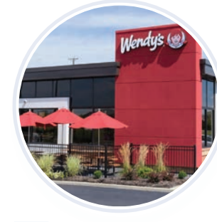
WENDY'S CALDWELL / KUNA SALE | 2,727 SF / 2,468 SF BUYER REPRESENTATION | OCTOBER 2024