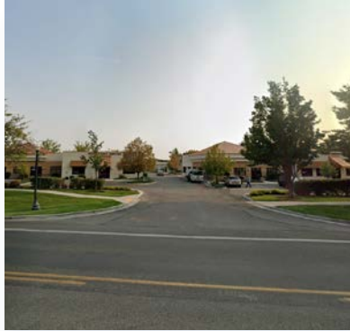
20,000 SF OFFICE INVESTMENT BUYER / SELLER REPRESENTATION