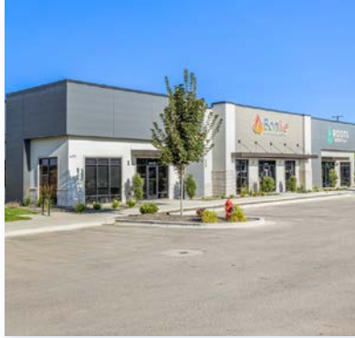
9,460 SF OFFICE SALE BUYER/SELLER REPRESENTATION