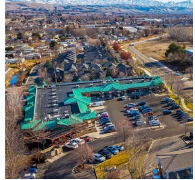
26,000 SF RETAIL CENTER BUYER REPRESENTATION