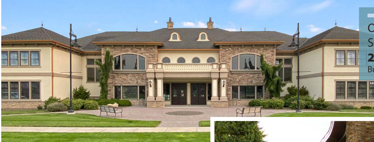
OWNER-USER CHARTER SCHOOL SALE 26,343 SQ. FT. Buyer/Seller Representation