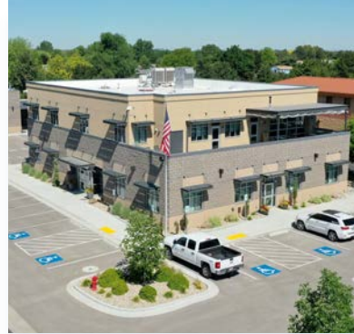
13,590 SF OFFICE INVESTMENT SALE/LEASE-BACK BUYER / SELLER REPRESENTATION