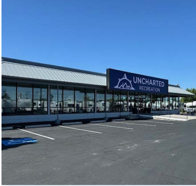
6,488 SF RETAIL SALE BUYER REPRESENTATION