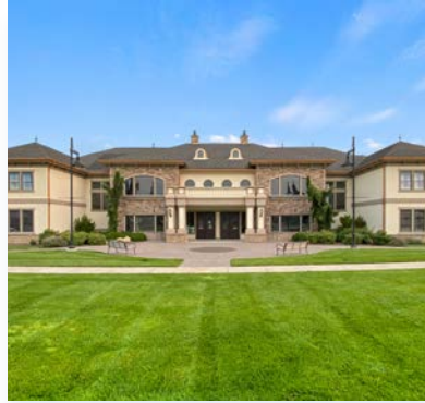
26,343 SF EDUCATION CAMPUS SALE BUYER/SELLER REPRESENTATION