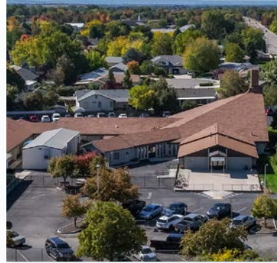
40,000 SF EDUCATION CAMPUS SALE BUYER REPRESENTATION