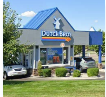
NNN RETAIL SALE BUYER REPRESENTATION