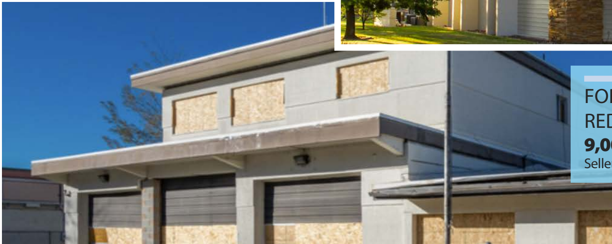
FORMER FIRE STATION REDEVELOPMENT 9,000 SQ. FT. Seller Representation