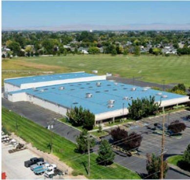
60,000 SF INDUSTRIAL SALE SELLER REPRESENTATION