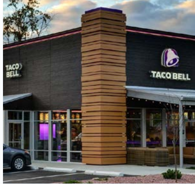
NNN RETAIL SALE BUYER REPRESENTATION