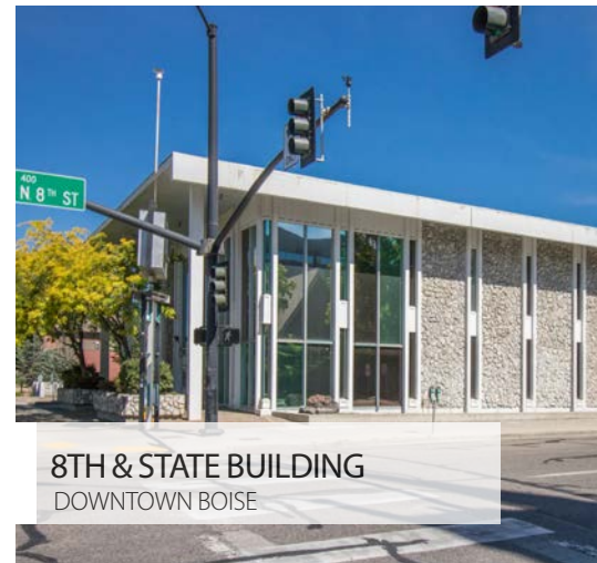
8TH & STATE BUILDING DOWNTOWN BOISE

Buyer Representation 56,320 SF INDUSTRIAL