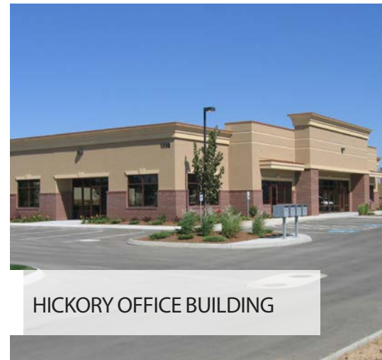
Buyer Representation 7,456 SF OFFICE