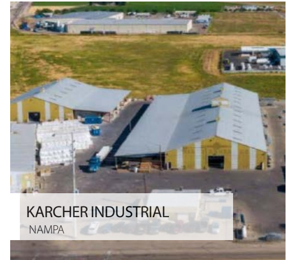
KARCHER INDUSTRIAL NAMPA

Buyer Representation 32,000 SF INDUSTRIAL