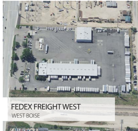
FEDEX FREIGHT WEST WEST BOISE

BUYER REPRESENTATION 1445 COMMERCE 124,446 SF INDUSTRIAL