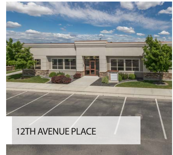
Seller Representation 15,360 SF OFFICE