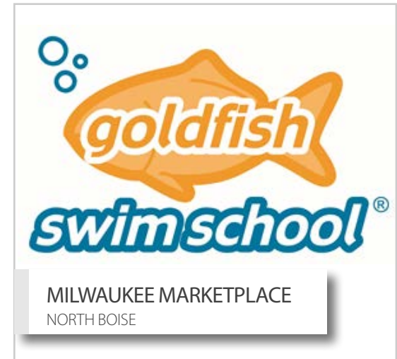
MILWAUKEE MARKETPLACE NORTH BOISE