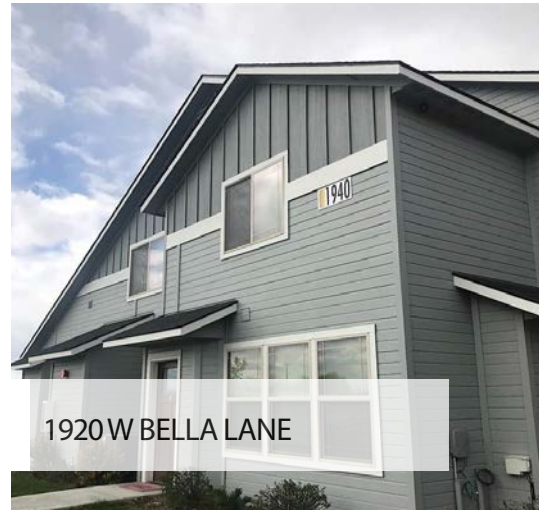
Buyer Representation 16 Units | 15,440 SF MULTIFAMILY

Phone: (208) 947-0802 | nick@tokcommercial.com