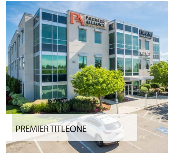
Seller Representation 42,419 SF OFFICE