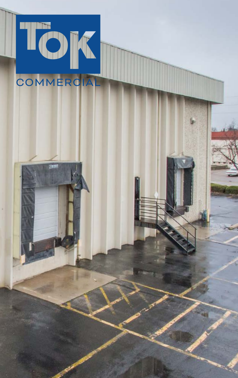
BUYER REPRESENTATION 322 N STEELHEAD WAY 60,000 SF INDUSTRIAL