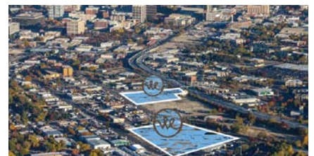
SOLD 6.50 acres Development Land