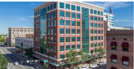
SOLD 92,000 SF Building