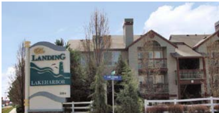
SOLD 300 Unit Apartment Complex