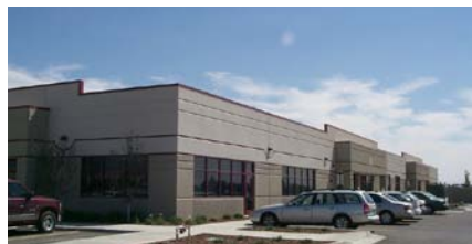
SOLD 26,000 SF Office Building