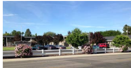
SOLD 70 Unit Apartment Complex