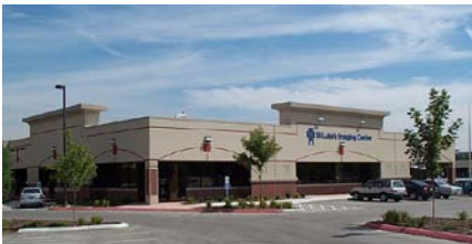
LEASED 29,039 SF to St. Luke's