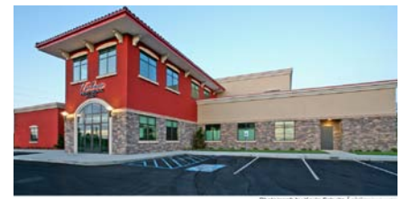
SOLD 36,675 SF Medical Office Building