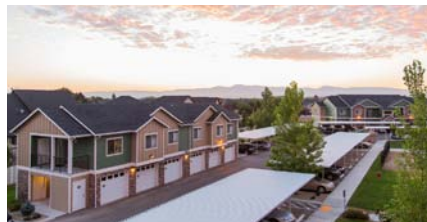
SOLD 171 Unit Apartment Complex