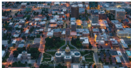
AUCTIONED 7 Commercial Properties | +$17,000,000 value