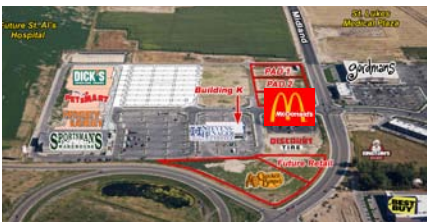
KARCHER INTERCHANGE - McDONALDS NNN Pad Investment