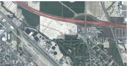
1085 TEN MILE 118 Acre Commercial Development Site