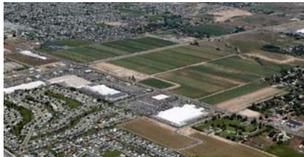
EAGLE & FAIRVIEW LAND 89.8 Acre Retail Development Site