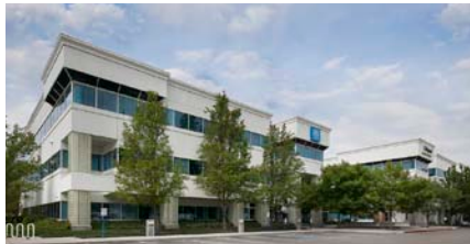
CAPITOL GATEWAY 62,611 SF Office Complex