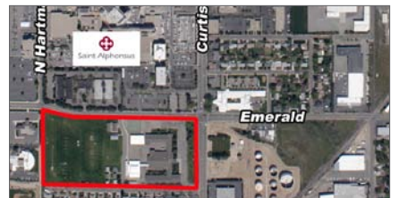
WEST JUNIOR HIGH SCHOOL SITE 17 Acre Commercial Development Site