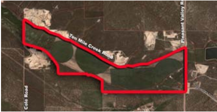
PLEASANT VALLEY LAND 419 Acre Development Site