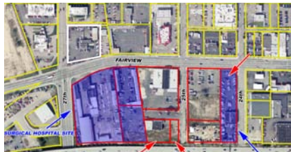
DOWNTOWN BOISE HOSPITAL LAND 12 Acre Retail Development Site