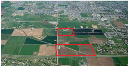
TEN MILE DEVELOPMENT 121 Acre Commercial Development Site